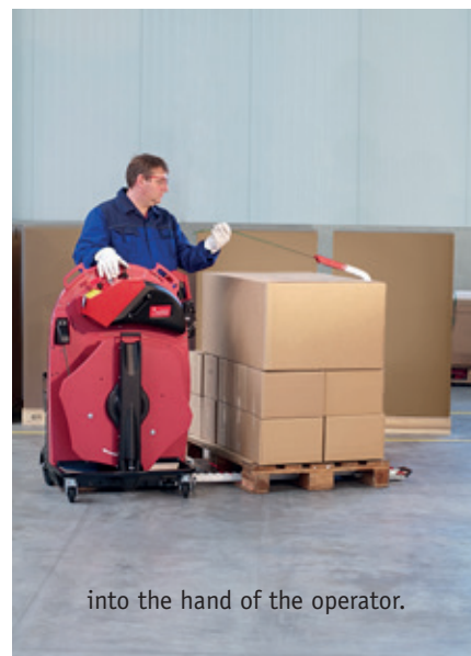
into the hand of the operator.