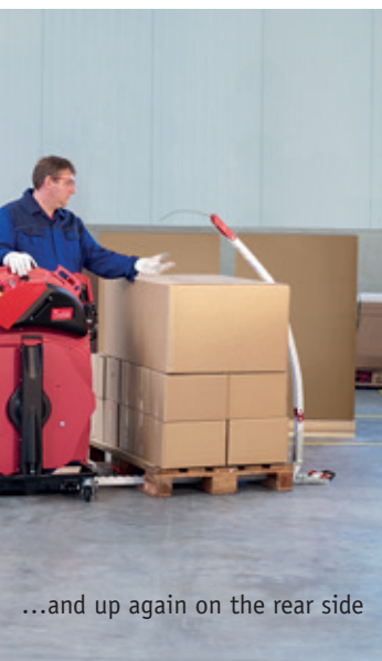
...and up again on the rear side

Even high packaging is no problem for ErgoStrap systems: with a further attachment, pallets up to 3.0 m in height can be strapped reliably and quickly.