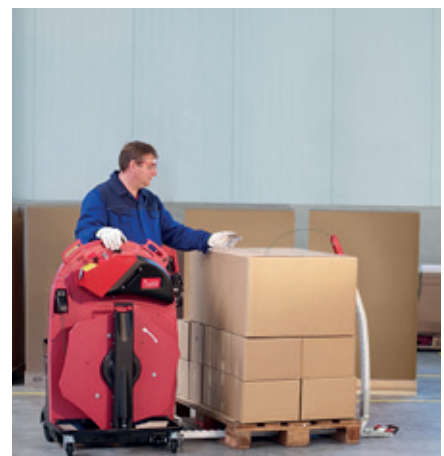
pulls the strap through under the pallet,...