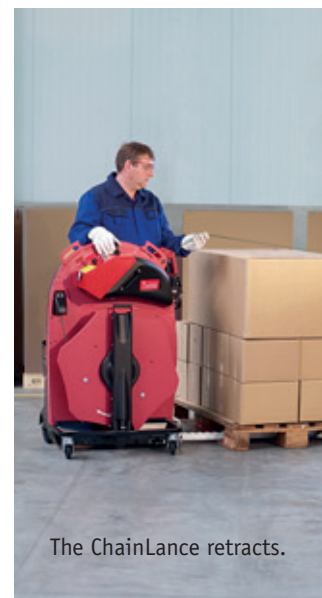
The ChainLance retracts.