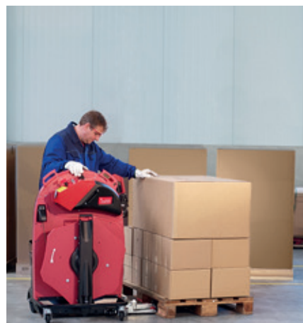
Roll the ErgoStrap in front of the pallet. The ChainLance...