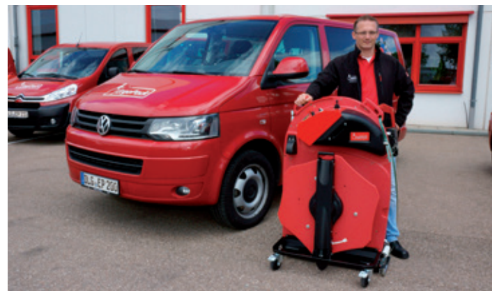
ErgoStrap provides training for customers' employees on delivery of the systems.

Today over 8,500 ErgoStrap systems have been sold in 55 countries throughout the world. The machines are easy to operate. But so that everything goes smoothly from the beginning, experts from ErgoStrap also provide employee training on the customer's premises on delivery of the systems. ErgoStrap - the name says it all: Ergonomic strapping of pallets and packages. Bending is now a thing of the past with ErgoStrap.